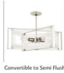
Convertible to Semi Flush