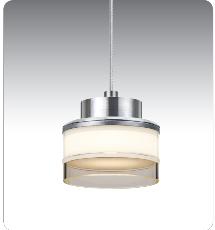
PIVOT SHOWN IN OPAL GLOSSY/SMOKE (PIVOTSM)