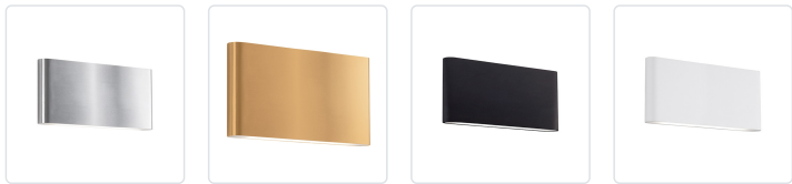
AT6510-BN Brushed Nickel AT6510-GD Gold AT6510-BK Black AT6510-WH White

This All-terior minimalist sleek cast aluminum wall sconce is a beautiful addition to any indoor or outdoor room. Finished with a high end brushed nickel or powder coated white cast aluminum, rectangular in size with smooth sleek rounded corners. Installed at the top and bottom of the fixture is our powerful 120V AC LED technology, covered by premium frosted optical lenses which omits the light from the fixture evenly against the wall. Available in two different styles and sizes view series for full family details.